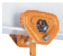
125kg to 3t