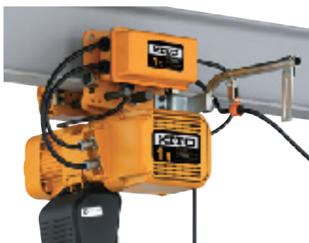
125kg to 20t